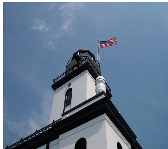
A beautiful day on the light in the summer of 2007. A photo like this could be the lucky winner!

The DRLPS is looking for unique pictures of the DeTour Reef Light. This contest is open to all amateur photographers and pictures become the property of the DRLPS. Additional information can be found on page 3. The winner will be announced at the 10 th Anniversary Gala on Saturday August 30 th .