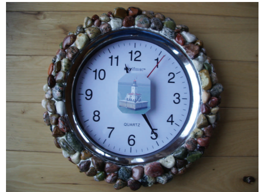
A close up of Paula's clock